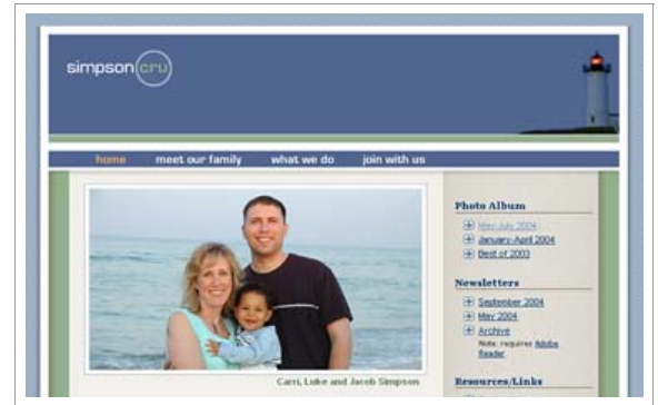
Whew! The site is finally done!

Why SIMPSONCRU? "Cru" has been adopted by many schools as the nickname for their movement as well as their weekly meeting. It fit nicely with our last name, and the domain (web) name was available. I was going to use "amazon.com", but someone must have gotten that one already.